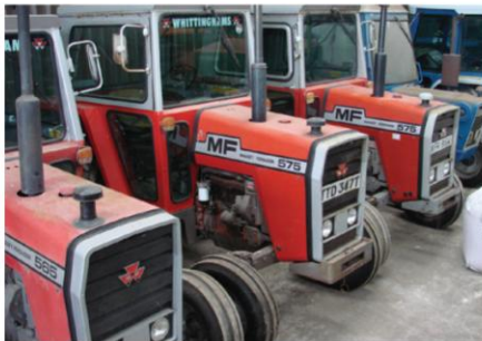
MF 575 2WD