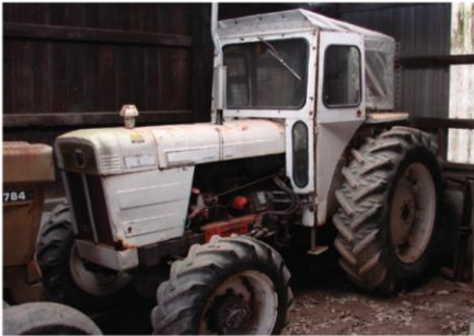
DB 1200 4WD Selectamatic