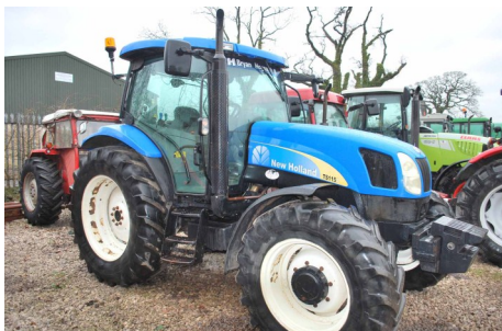
2007 Case Maxxum 115 £17,000 (below)

1995 MF 3095 £5,600, 1995 MF 399 4wd £8,000, 2008 Zetor 954! £17,500, 2003 John Deere 6320 £14,500, 2012 MF 5420 with loader £30,000. 2004 New Holland TSI 15A £18,000 (pictured top middle) and a