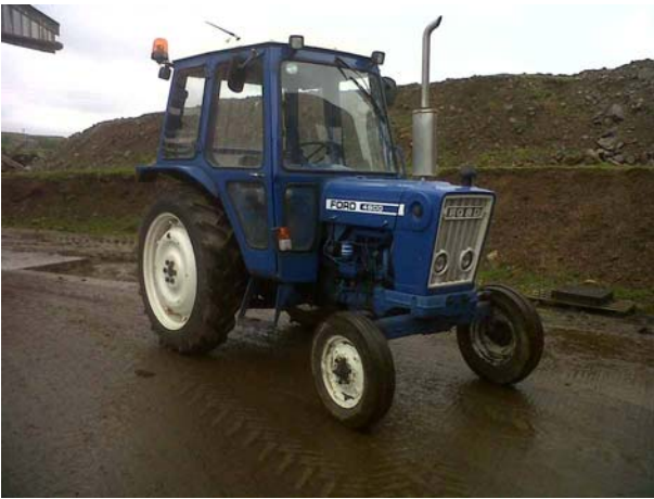
Ford 4600 1979 3 Cylinder Tyres 60% all round, Recent Full Electric Rewire Full Working Lights Excellent Starter and Very Good Condition Log Book NO VAT