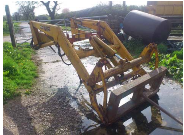
MF 80 Power Loader With Big Bale Spike 3 rd Service Will Fit 100, 500 Series Tractor VAT