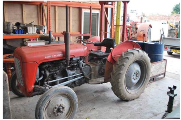
MF 35X 3 Cylinder VAT