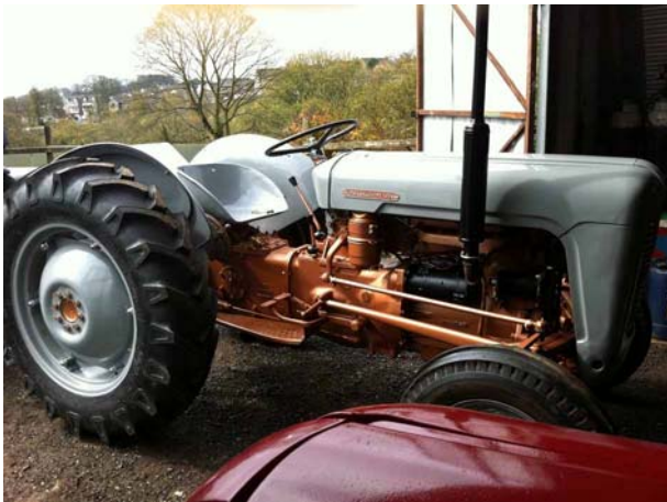
Ferguson FE35 1957/1958 Fully Restored New Wings Tyres Exhaust NO VAT