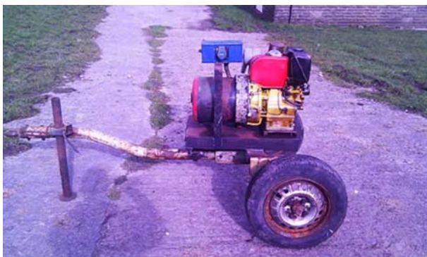
4 inch Lister Water Pump (little used) NO VAT