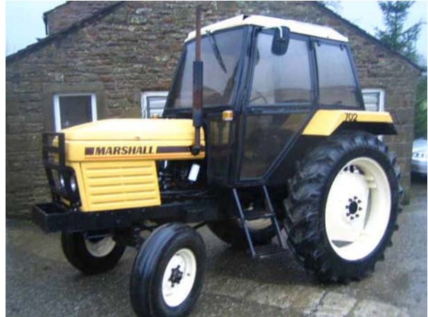
Marshall 702 'D' Reg 1986 – 2 Owners VAT