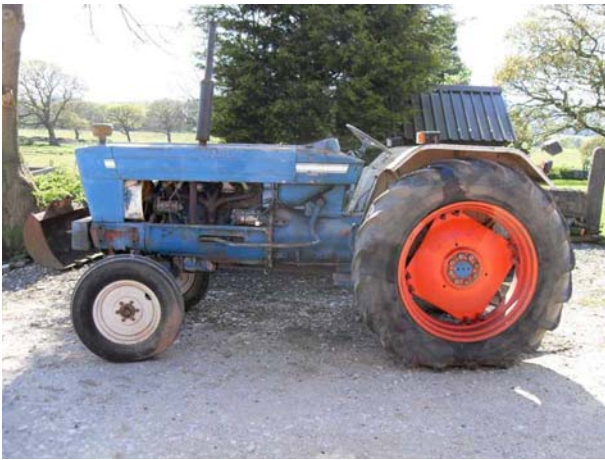
Ford 5095 2wd Rare Ford 6 Cylinder Conversion VAT