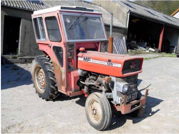
MF 135 Mark 3 Vineyard Tractor c/w Duncan Cab VAT