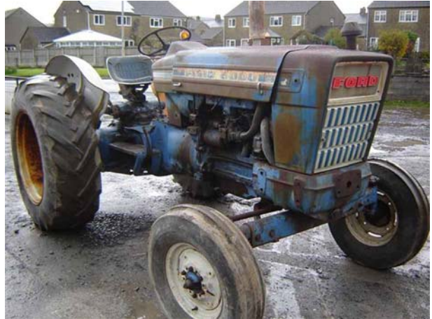
Ford 5000 Petrol NO VAT