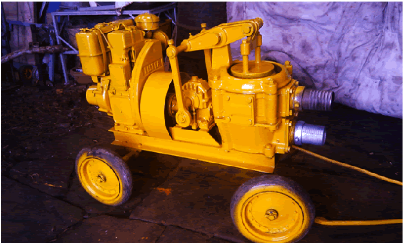
Site Generator 240/110 volt NO VAT