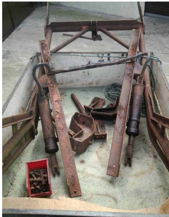
Nuffield DM4 Loader (no buckets) NO VAT