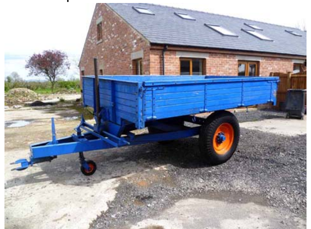
1940's -1950's Martin Markham Screw Tipping Trailer, (been restored) NO VAT