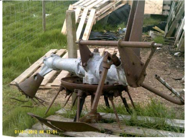
Ferguson Potato Spinner (spares/repairs) NO VAT