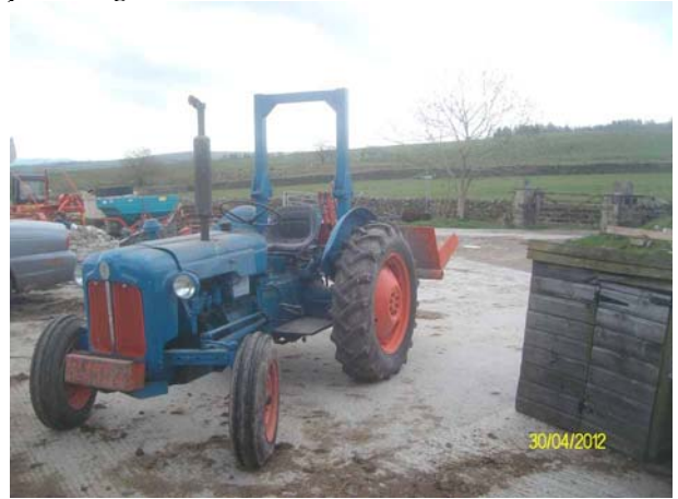
Ford Dexta 1959 Log Book Good Condition NO VAT