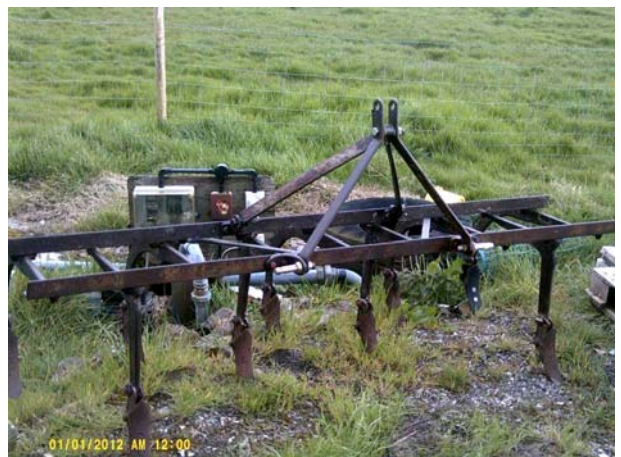
Ferguson 9 Tine Cultivator NO VAT