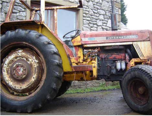
International 574 NO VAT