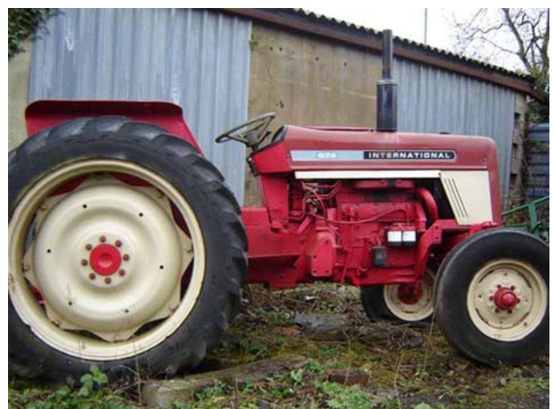
International 674 NO VAT