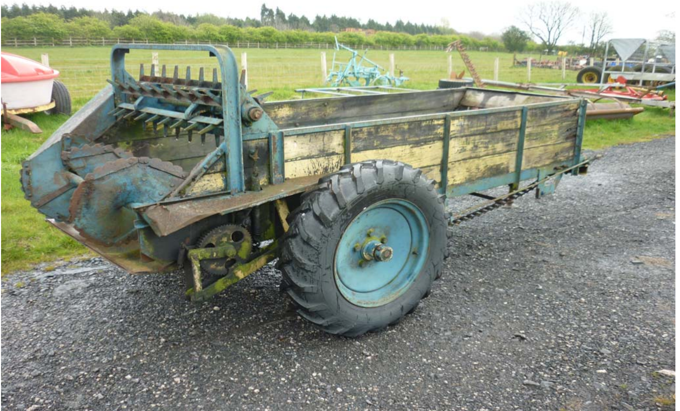
Bamford FSL1 Land Drive Manure Spreader