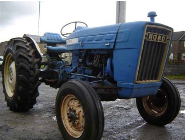
Ford 3000 Petrol 4 Speed NO VAT