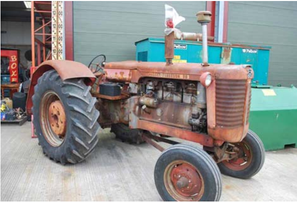
MF 95 VAT