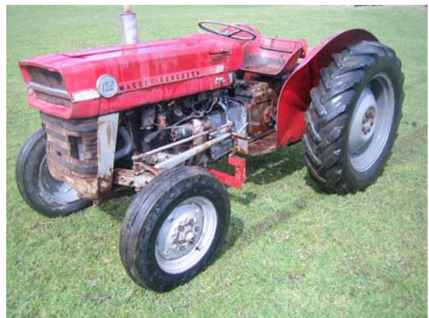
MF 135 - Petrol VAT