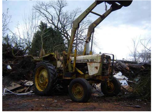
David Brown 996 Fitted with Broughton 2 Speed Winch NO VAT