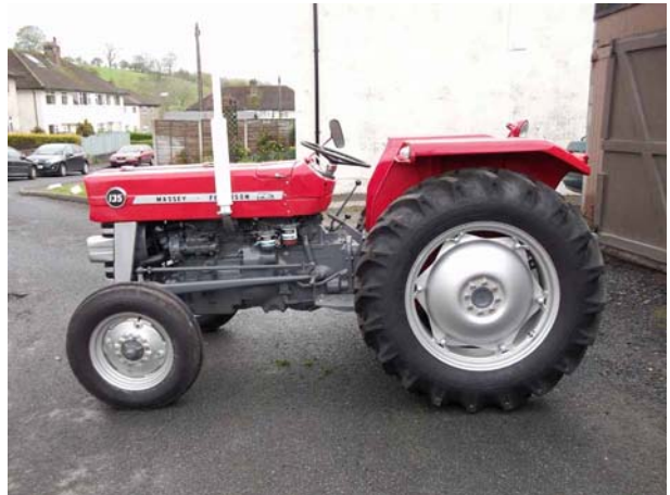
MF 135 1968 Fully Reconditioned Engine New Clutch, Hydraulics Reconditioned All New Tin Work, New Tyres, New Wheels Full Re-Spray NO VAT