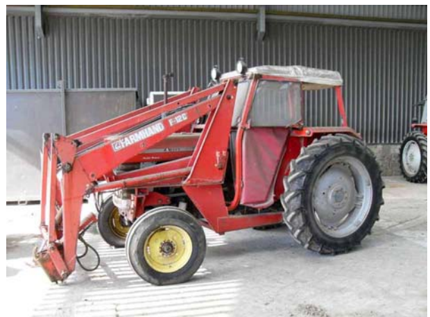
MF 188 Multi Power c/w Power Loader VAT