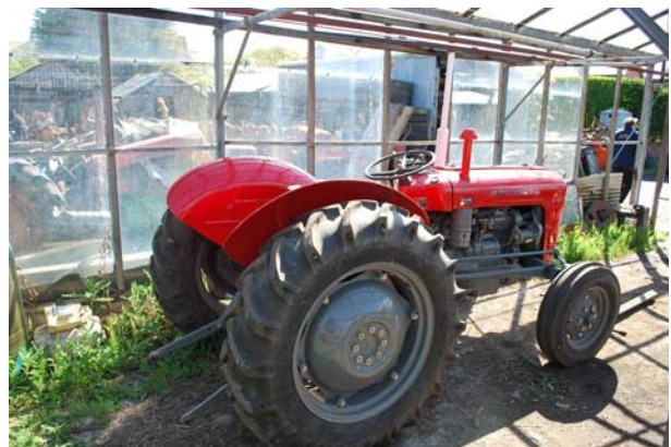
Massey Ferguson 35X V5 Fully Reconditioned NO VAT