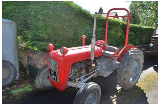
Massey Ferguson 35 1962 V5 1962 Reg 191AWY NO VAT