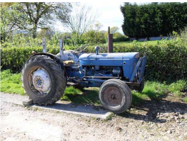
Fordson Super Dexta VAT