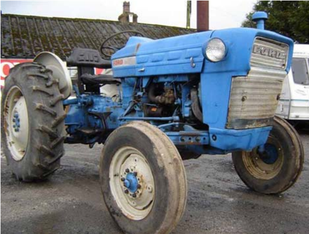
Ford 3000 Petrol 6 Speed NO VAT