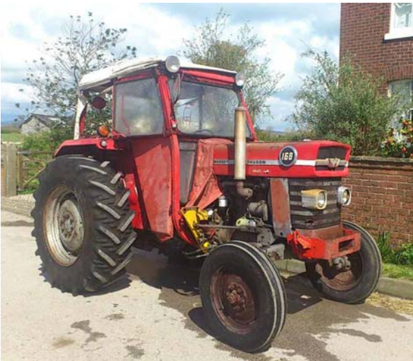
Massey Ferguson 168 Multipower XTF 399N V5 One Owner From New VAT