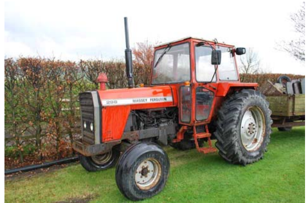
MF 298 Reg D341 AFV Approx 5000 hrs NO VAT