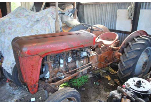
Ferguson 35 Gold & Grey 1957 V5 NO VAT