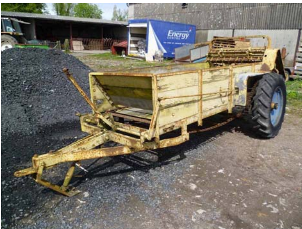
1940's -1950's Bamford Land Driven Muck Spreader (original paint very little used) NO VAT