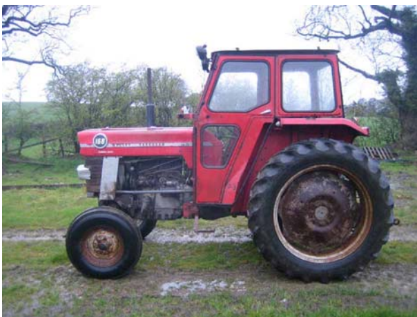
MF 168 with Secura Cab, Power Steering VAT