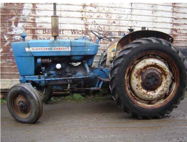
Ford 4000 Barn Find VAT