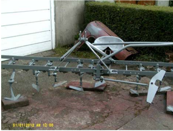
Ferguson Steerage Hoe NO VAT