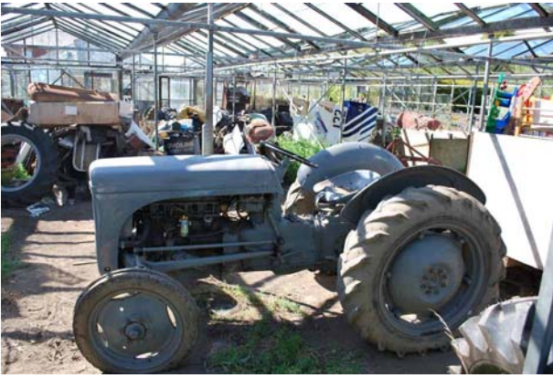
Ferguson TED 1950 Reconditioned Engine NO VAT