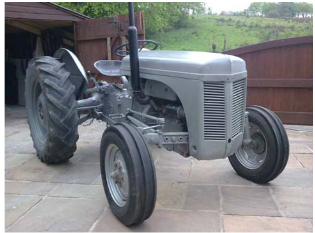
Grey Ferguson Approx 1947 Running Order Not Road Licensed Standard Petrol Engine with Lifter attached to rear Very Clean Machine NO VAT