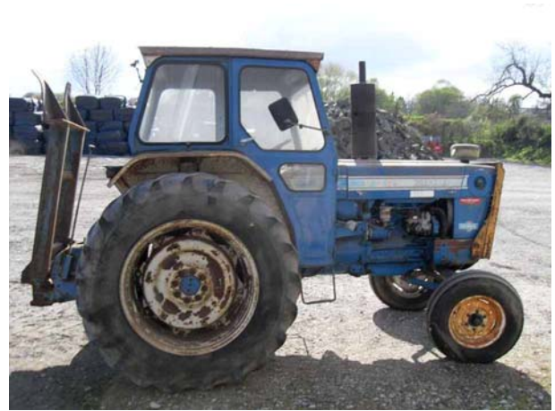
Ford 7000 c/w Winch VAT