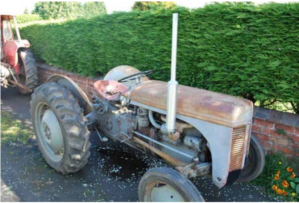
Ferguson TEF 1954 Good Runner NO VAT