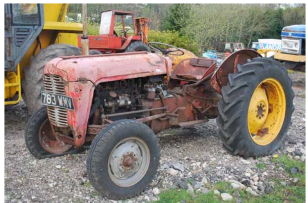
MF 35 4 Cylinder VAT