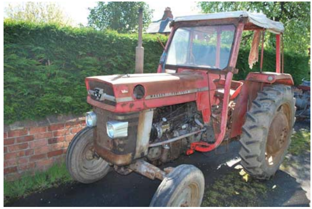
Massey Ferguson 165 Barn Stored NO VAT