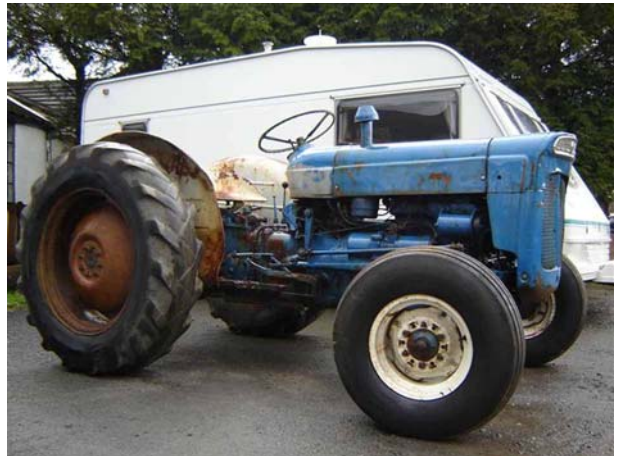
Fordson Super Dextra Fitted with Down Draft Exhaust NO VAT